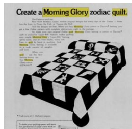
Ad for Zodiac Quilt from Taylor Bedding Company, 1978.